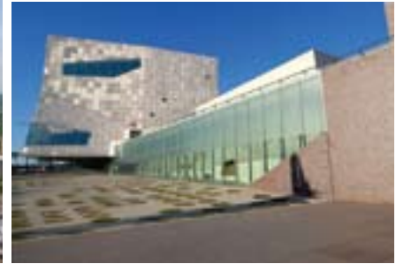
(left to right) Accenture Tower, LaSalle Plaza, Wells Fargo Center, and the Walker Art Center located in Minneapolis, MN